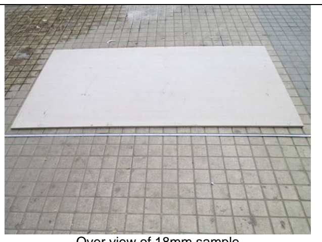
Over view of 18mm sample